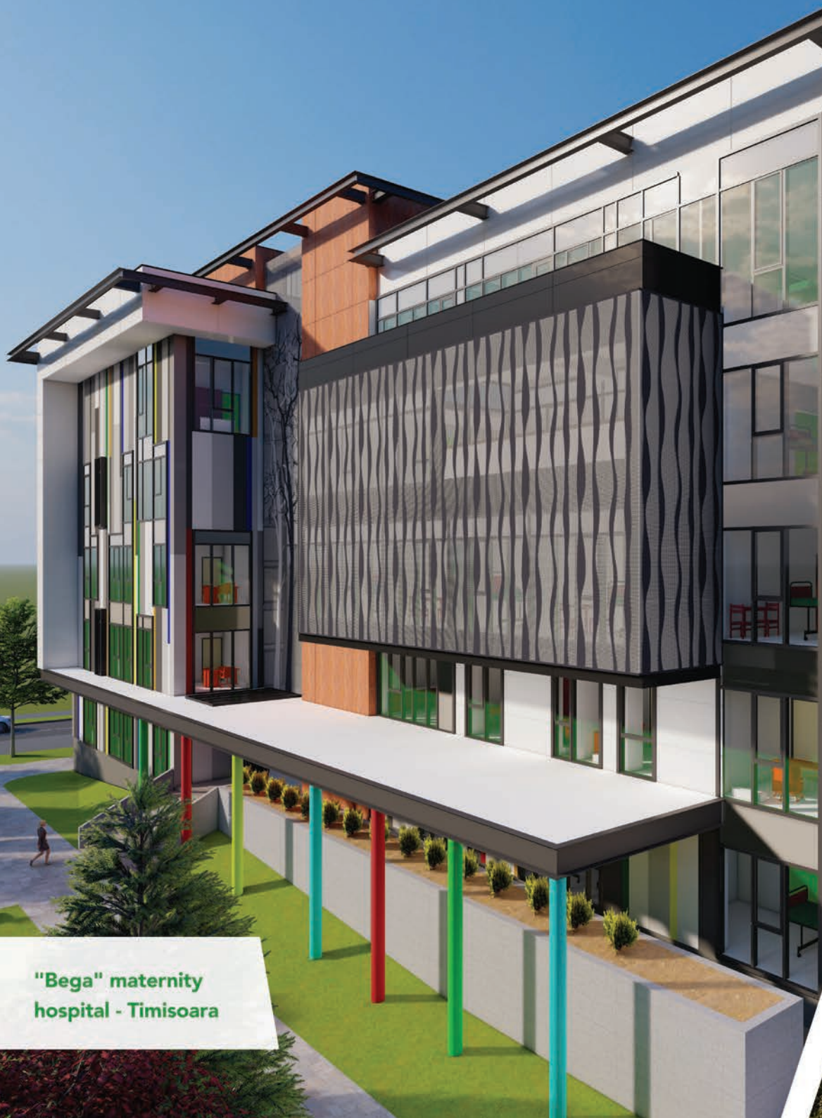
"Bega" maternity hospital - Timisoara