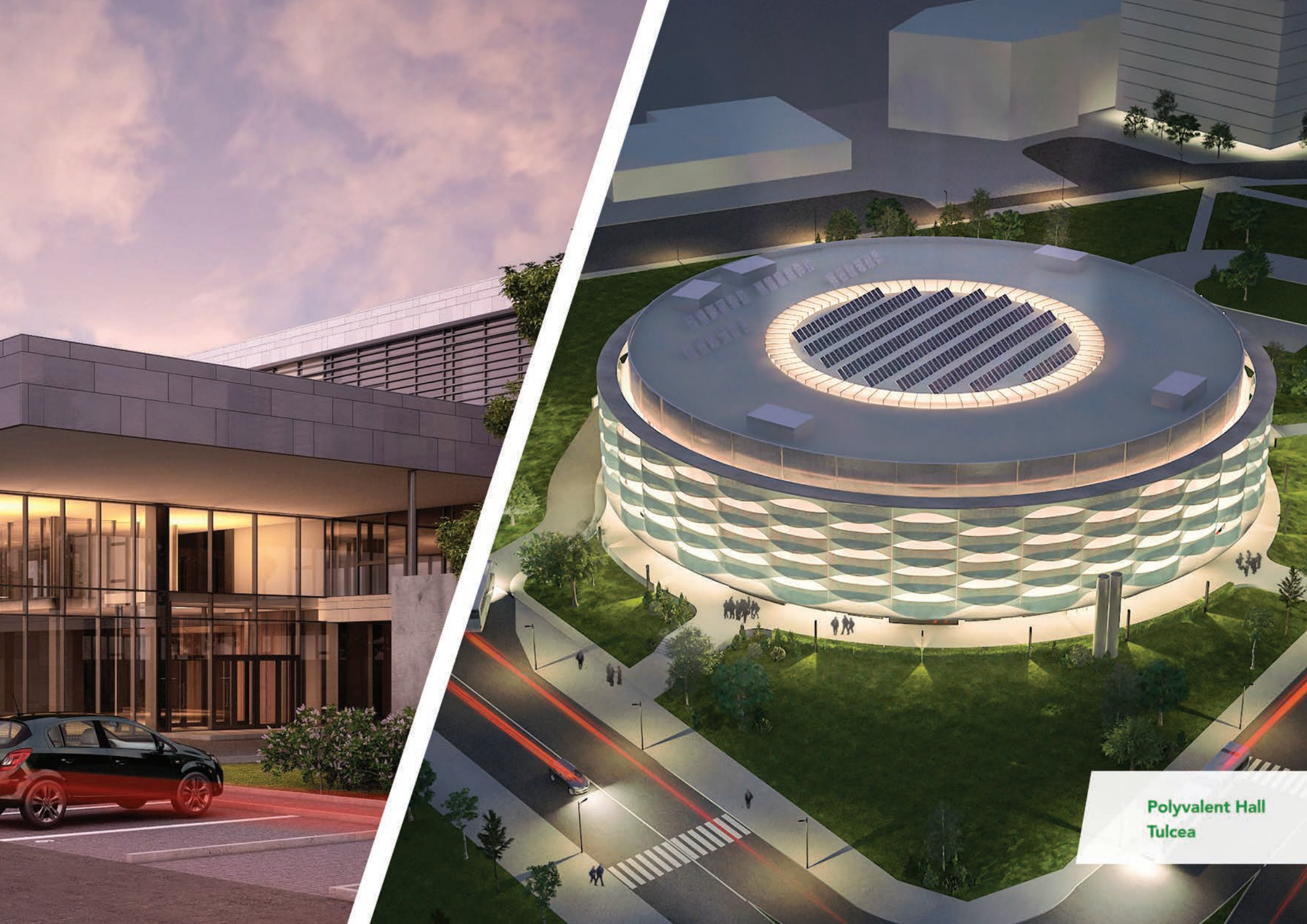
Polyvalent Hall Tulcea