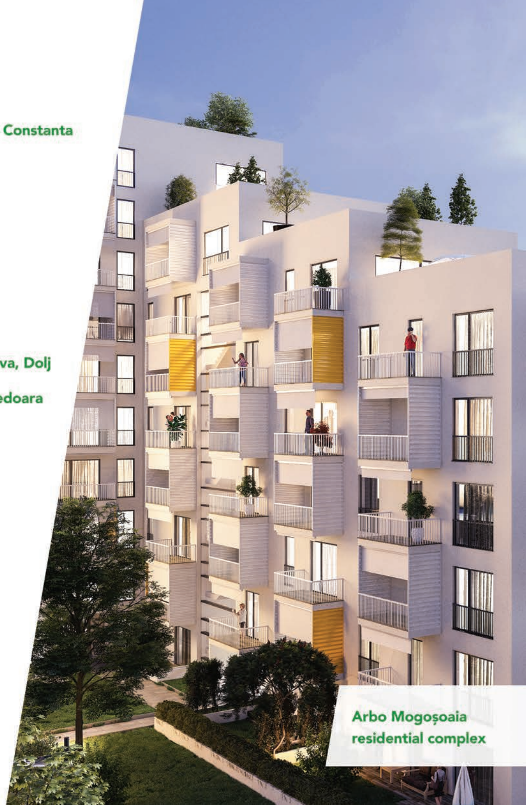
Arbo Mogosoia residential complex