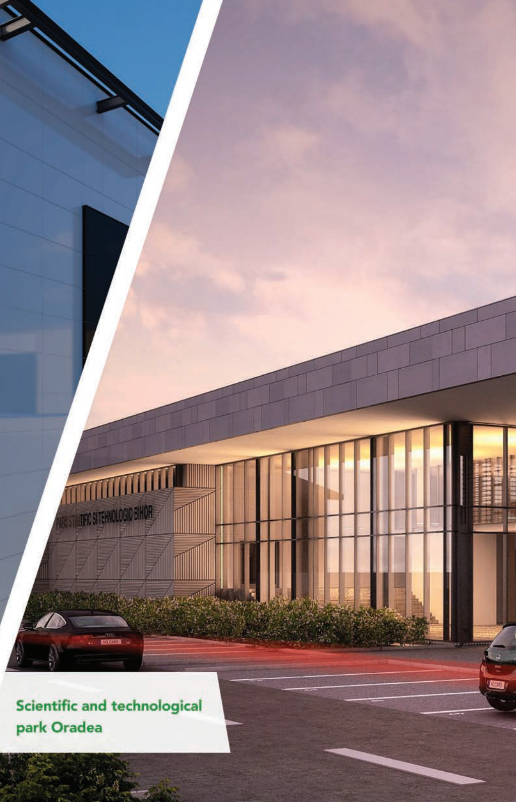
Scientific and technological park Oradea